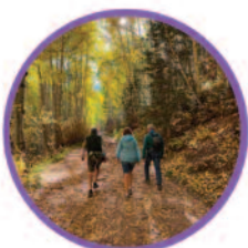
Health & Wellbeing